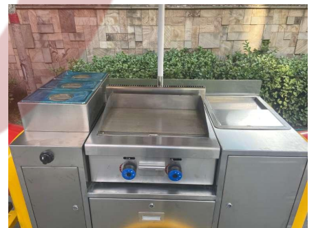
- Countertop -