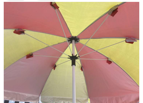
- Umbrella -