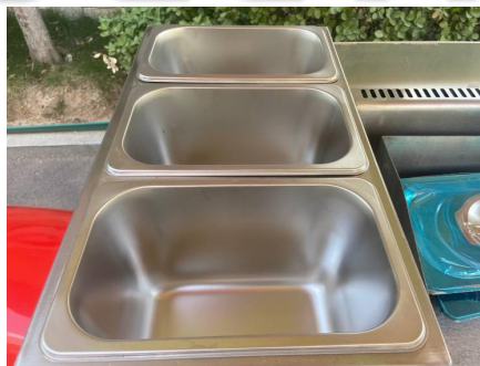
- Interior -