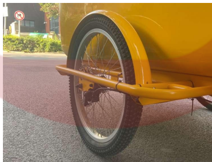
- Wheel -